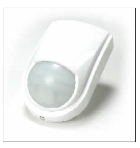
39 foot (12 m) range, 110 degree coverage with convex honeycomb hemispherical infrared lens