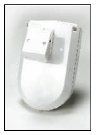
Shown with supplied wall mount bracket

Note: This module must be "Included in the Network" only where it will be permanently installed . The proper operation of this node in the <u>mesh</u> <u>network</u> is dependent on it knowing its location with respect to other nodes. You cannot "test bench" configure this module.