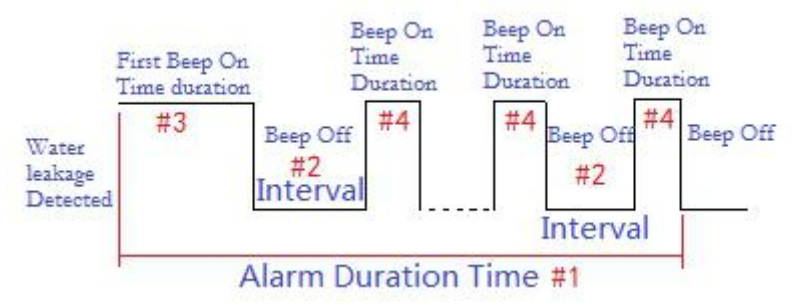
Fig.1 Alarm Time Setting Figure